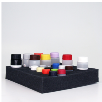
Tryptophan ELISA kit