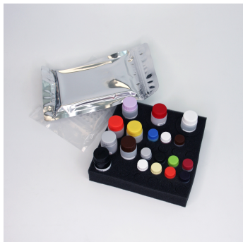
Tryptophan ELISA kit